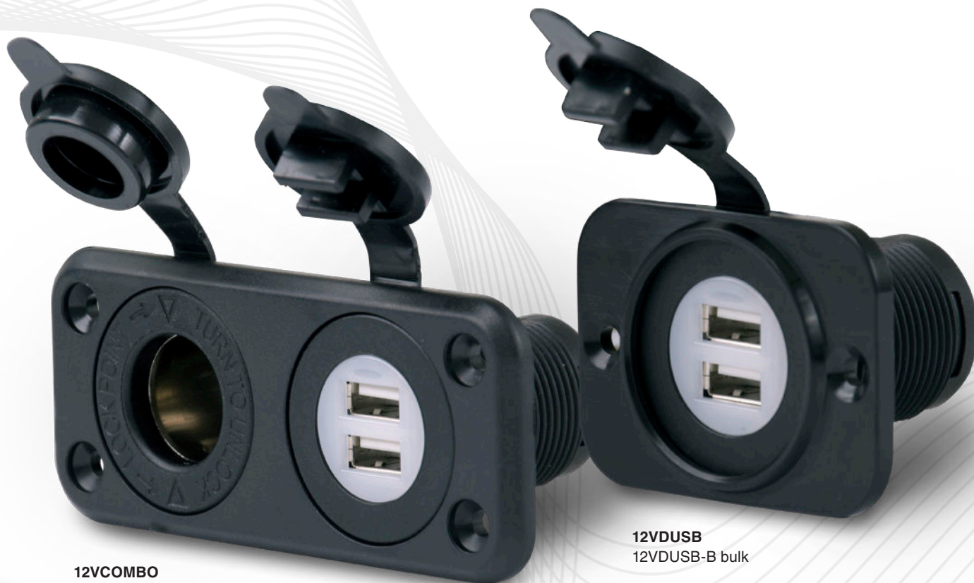
12VCOMBO 12VCOMBO-B bulk